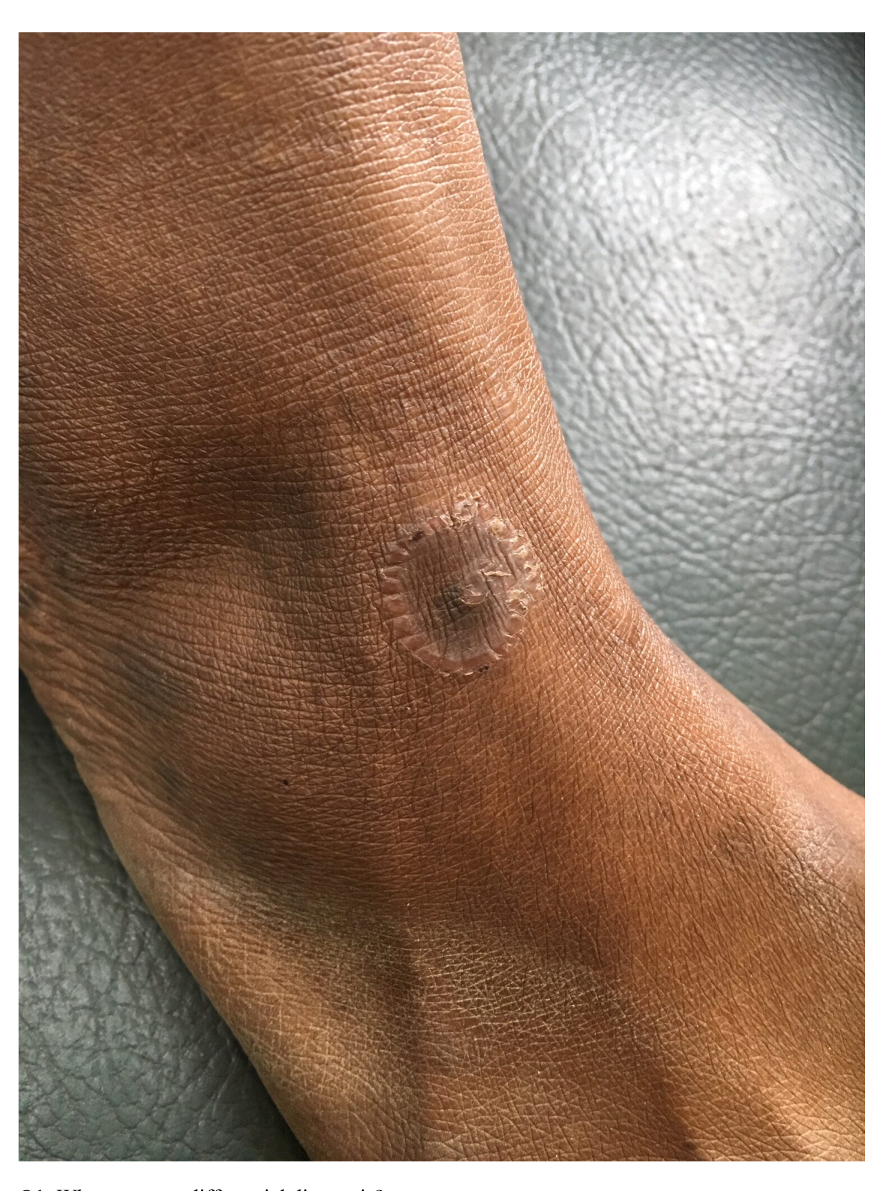
Q1. What are your differential diagnosis?